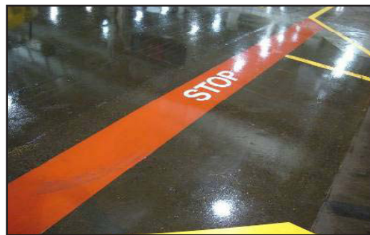
RapidShield™ Stop Sign and Isle Way