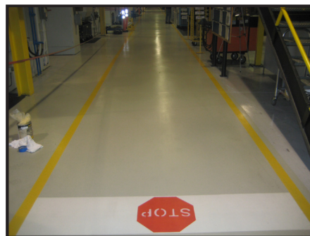
RapidShield™ Isle Ways and Stop Sign

Quaker's RapidShield™ floor coating products are unique in the industry. These revolutionary products utilize state of the art UV light technology in order to dry nearly instantaneously, providing a surface with superior gloss, hardness and chemical resistance. Special photo initiators present in the floor coating cause it to harden so rapidly the "wet look" of the coating is locked in place, and allow the floor to accept industrial traffic within mere seconds of being exposed to the special UV-light system. During the hardening the coating "cross links" forming a 3-dimensional polymer with far greater hardness and superior chemical resistance to conventional coatings that require hours or days to fully harden.